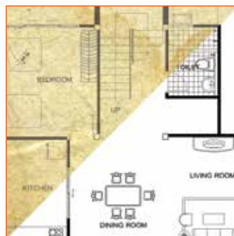
Improve your originals