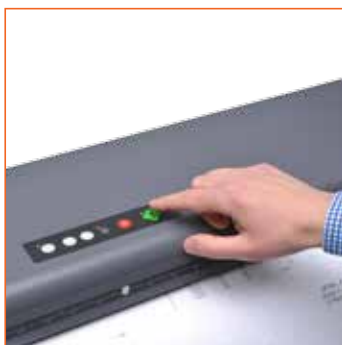
Flexible control panel for easy handling

Scan and document all your architectural, engineering and construction plans in standard file formats directly into your project folders.